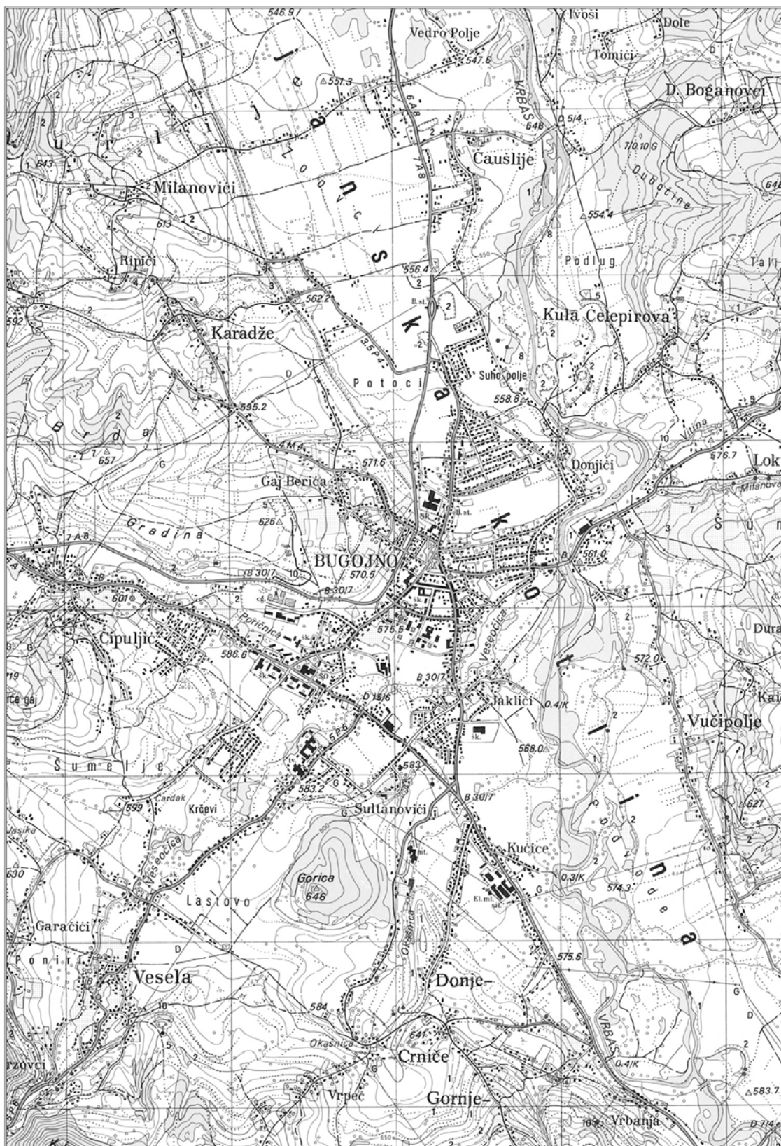
BUGOJNO HADZIHASANOVIC & KUBURA IT-01-47 Base map Jajce 473-4-4 TK25 (original scale 1:25,000) M&P 15 March 2006